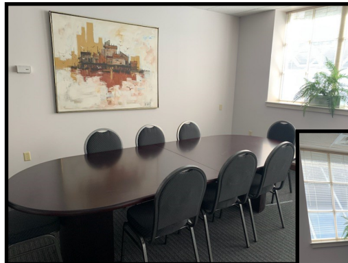
Individual offices with shared kitchenette & conference room